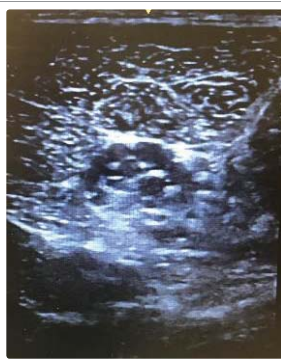
Figure 2: Tibial nerve.

was considered but not performed as the patient's history of scoliosis would have made this anesthetic significantly more challenging. We utilized ultrasound, as demonstrated by Desai, et al. [6] to safely guide popliteal nerve blockade. Our ultrasound scan of the popliteal fossa using a linear probe demonstrated multiple hypoechoic structures within the popliteal nerve. These hypoechoic structures were concerning for neurofibromas, as seen in the report by Rocco and Rosenblatt [7]. The common peroneal and tibial nerve branching was not easily identified as they should have been seen converging from the popliteal nerve. As seen in figure 1, there were concerns for having adequate local anesthetic infiltration of the endoneurium as well as considerations for nerve damage and an insult to the neuromas with an inadvertent puncture of the nerve by the 22G short-bevel needle. A more caudal approach was utilized to block the right superficial and deep peroneal nerves, and tibial nerve as seen in figure 2.