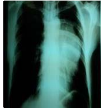
Figure 1: Chest radiograph (PA view) showing left paracardiac mass occupying left hemithorax.