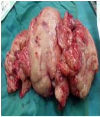
Figure 3: Gross view of the resected specimen showing a well-encapsulated, cystic tumour filled with haemorrhagic material with areas of necrosis.

asymptomatic or may present with symptoms of compression of the mediastinal structures [7]. As but our patient present with dry a cough and dyspnea since six months that was associated with weight loss (10 Kg) and change in voice with the giant mass of mediastinum. Less frequently, a carcinoid tumor may present with of various endocrine disorder as Cushing syndrome [2].