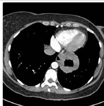
Figure 1: CT chest showing a large hiatus hernia and the tumour

This was followed by an enhanced Computed Tomography (CT) Thorax (Figure 1) that showed the CXR abnormality corresponded to a possible 6 cm sequestered lung segment. After discussion in the respiratory Multidisciplinary Team (MDT) meeting she was investigated further with a bronchoscopy. However, the bronchoscopy was normal and bronchial washings did not show any malignant cells. A positron emission tomography computed tomography (PET/CT) was then performed and showed a 6.5 cm thick-walled air filled mass in the lower lobe of the left lung with intense peripheral Fluoro Deoxy Glucose (FDG) uptake suspicious of a malignancy. A barium swallow showed the lesion seen on CT to be continuous with the lumen of the oesophagus (Figure 2). Following this, a large HH at 25 cm was visualised on an Oesophago Gastroduo Denoscopy (OGD) examination.