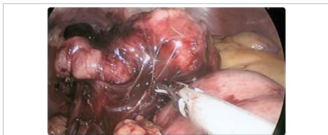
Figure 5: Delivery of the oesophageal GIST into the abdominal cavity.