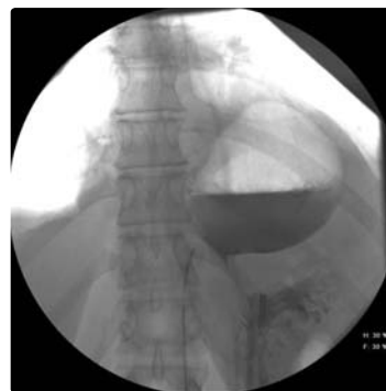
Figure 2: Barium swallow showing the hiatus hernia.