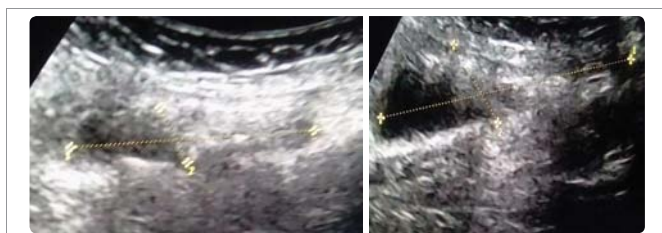
Figure 1: Ultrasound image showing cystic structure in right iliac fossa suggestive of appendix with multiple echogenic foci.