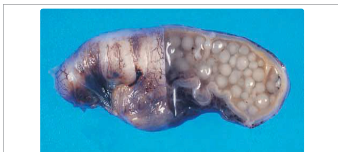
Figure 2: Gross specimen of appendix showing multiple opaque globules. The appendiceal lumen is filled with pearl- or fish egg-like mucin globules.