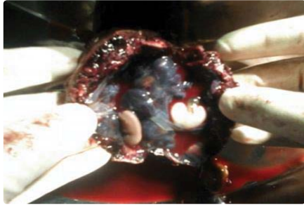
Figure 2: Pathological evaluation of the surgical specimen showed a diamniotic monochorionic twins pregnancy.

twin tubal pregnancy is not clear however several factors contribute to the occurrence of ectopic pregnancy. In the present case it was a spontaneous conception. No history of pelvic inflammatory disease, use of ovulatory drugs artificial reproductive technique was asked.