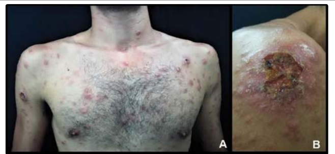
Figure 1: (A) Papulo-nodular erythematous lesions, some ulcero-crusted in the trunk and upper limbs. (B) Plaque with central ulceration covered by meliceric and hematic crusts on the right shoulder.

HIV Polymerase Chain Reaction (PCR), also negative. However, the serology for syphilis this time was positive, with VDRL titre at 1/256 and Treponema Pallidum Haemagglutination test (TPHA) reagent.