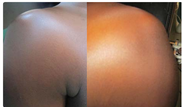
Figure 1: A.Y: appearance of the 2 dislocated shoulders just before reduction maneuvers under general anesthesia.

The biological check-up showed no significant abnormality, particularly a normal fasting blood sugar of 0.90g / l. The Electroencephalographic tracing (EEG) was normal. We programmed emergency surgery to be carried out under general anesthesia including a reduction and internal fixation (temporary arthrodesis by 2 cross pins) and external restraint by the elbow-to-body Dessault bandage. This reduction was done, under general anesthesia with maximum muscular relaxation, and progressive soft maneuvers described by Kocher : traction in the axis of each upper limb, external rotation and abduction [Figure 4].