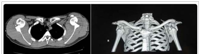
Figure 3: Same patient: computed tomography with reconstruction images: bilateral dislocation with bilateral notch of Malgaigne (or fracture of Hill Sachs).