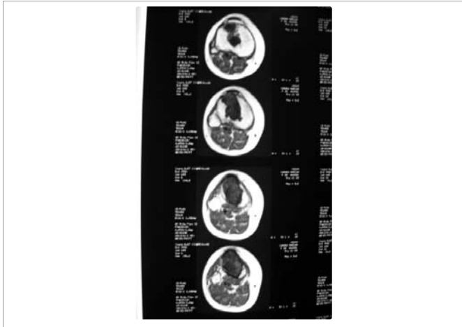
Figure 3: Transverse T1 cuts, showing the anteroposterior involvement of the tibia. No soft tissue invasion.