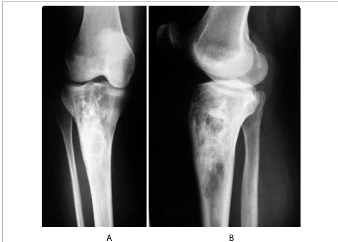
Figure 4: Three years after curettage and bone grafting, multiloculated osteolytic lesions of the proximal tibia extending to the cartilage.