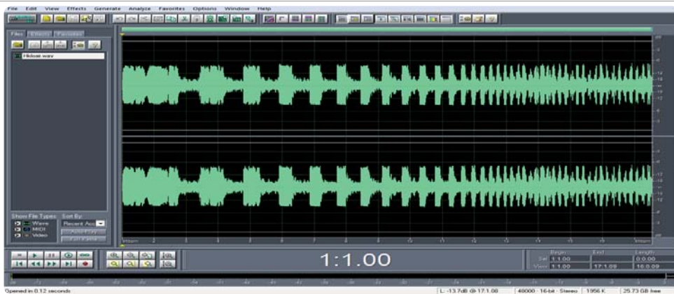
Figure 2: H.klosii vocal sample of one 'call'.