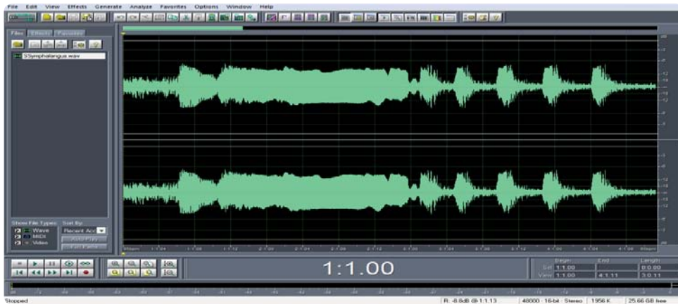
Figure 1: S.syndactylus vocal sample of one 'call'..