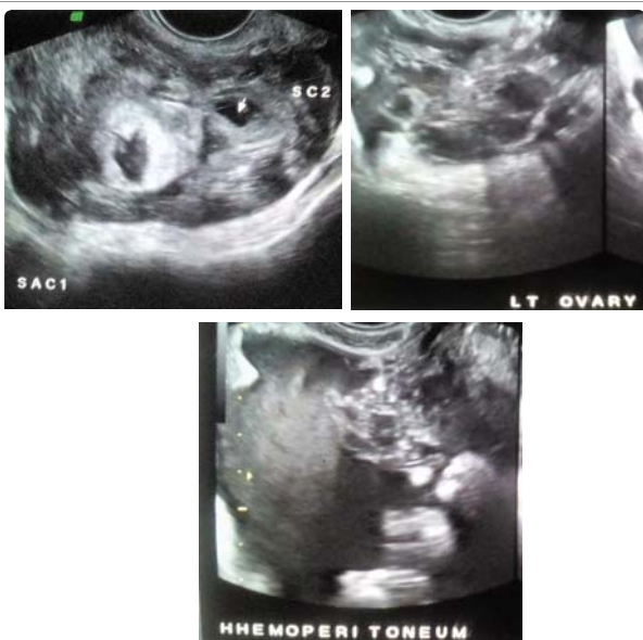
Figure 3: Trans vaginal Sonography shows Right adnexa heterogenous mass with two irregular sacs and hemoperitoneum. Left ovary is visualised.