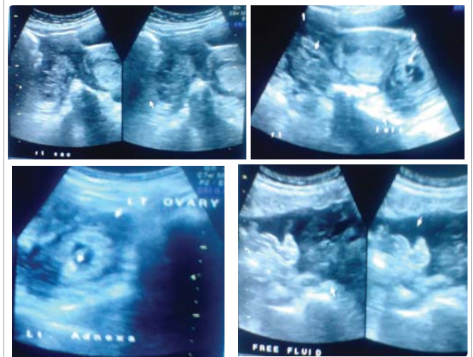
Figure 4: Trans vaginal Sonography shows both adnexae heterogeneous mass with two irregular sacs and hemoperitoneum. Both ovaries are visualised.

and bleeding per vaginum since morning. Upon examination, her vitals were stable. Abdomen examination was unremarkable. Upon per vaginum examination the cervical movement was tender, the uterus was bulky and soft, and boggy and tenderness were felt in the both adnexae. However, her urine pregnancy test was positive. Spontaneous pregnancy there was no history of induction of ovulation by drugs or artificial reproductive techniques the patient was taken for ultra sonography. Transvaginal Sonography showed a heterogeneous mass in right adnexa with irregular Gestational sac measuring approximately 1.0 cm corresponding to 5 weeks 5 days Right ovary was visualised separately from this mass.