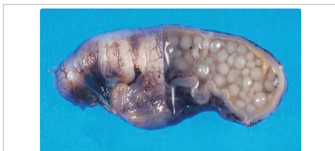
Figure 2: Gross specimen of appendix showing multiple opaque globules. The appendiceal lumen is filled with pearl- or fish egg-like mucin globules.