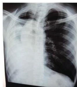
Figure 1: Chets X-ray showing opacified right hemithorax with volume loss.

Imaging was done and x-Ray of his chest revealed just opacified right hemithorax with loss of volume (Figure 1). CT-Scan showed the chest tube penetrating the right lung up to just prior to trachea completely traversing the right main bronchus and there is right lung volume loss (Figure 2). Bronchoscopy revealed a healed stump of the right main bronchus confirming that partial transection was followed with complete healing (Figure 3). Diagnosis of partial transection and healing of the right main bronchus suspected and the patient was advised to travel abroad where a complex thoracic surgery for bronchus reconstruction and lung expansion was successfully performed.