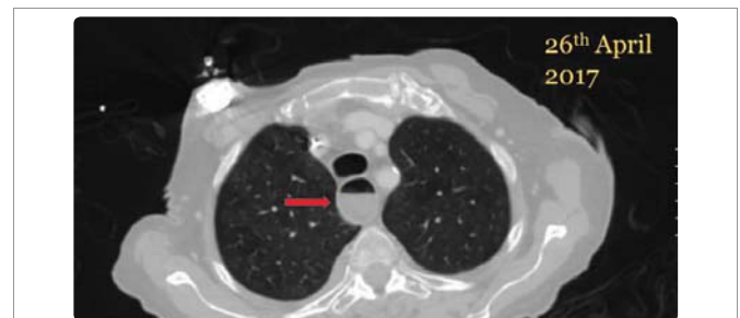
Figure 3: CT scan of the chest showing markedly dilated esophagus with a clear air fluid level (arrow).