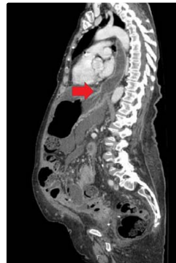
Figure 6: Another sagittal view of the esophagus. This time, the LES is better visualized and characteristic "bird's beaking" of achalasia is absent.

between onconeural antigens and neurons in the myenteric plexus that is responsible for esophageal dysfunction and achalactic transformation.