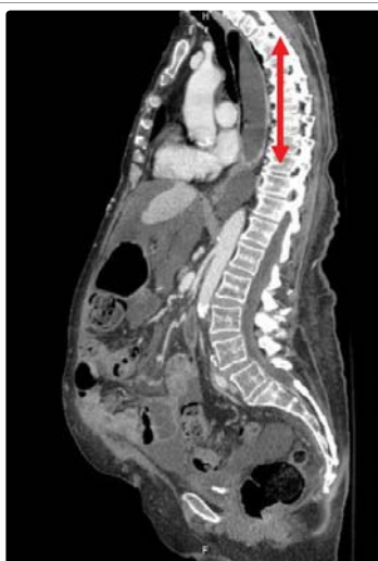
Figure 5: Sagittal view of the dilated esophagus with an air fluid level. Note: the patient is lying horizontally.