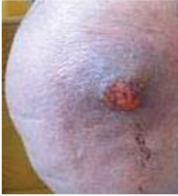
Figure 2: A firm erythematous draining nodule on the right knee.