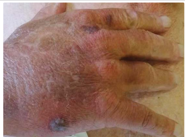
Figure 1: Well-defined deep red papulonodules on the dorsal surface of the right hand.

According to Esterly, tetracyclines have been effective in reducing neutrophil chemotaxis [6]. Clinical improvement has been reported