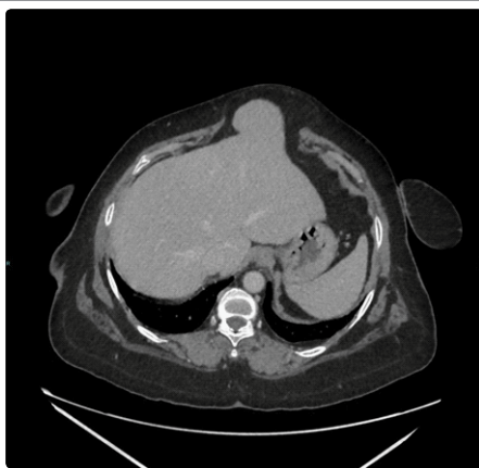
Figure 3: Axial CT scan image (venous phase) shows the herniated liver parenchyma through the epigastric anterior abdominal wall defect, the herniated part appear isodense to the normal liver.