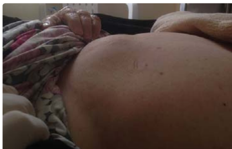
Figure 4: Incisional hernia through sternotomy incision.