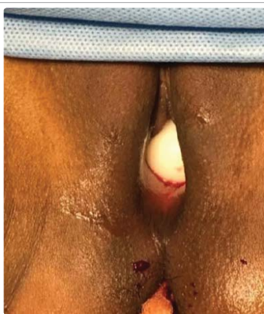
Figure 8: Acrylic olive ball onto the blind vagina.