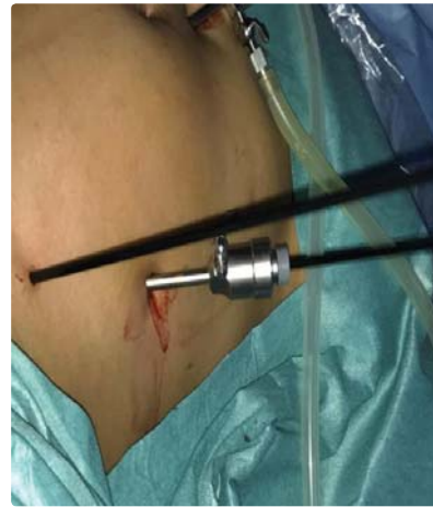
Figure 4: Stab incision adjacent to the lateral port.