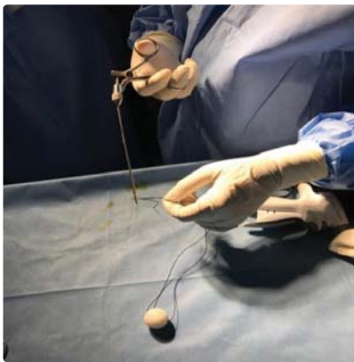
Figure 2: Silk thread fed into olive head needle.

All patients were admitted for a week postoperatively and gradual traction was given every day. Urethral catheter was kept inset for seven days and IV intravenous antibiotics were administered for 24 hours. Patient was started on soft diet from second day post-surgery. Traction was removed on postoperative day-7 and vaginal length was checked. All women were instructed to use dilators (soft and blunt)