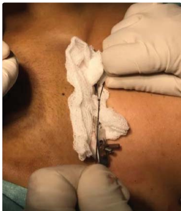
Figure 7: Silk thread fixing into traction device.