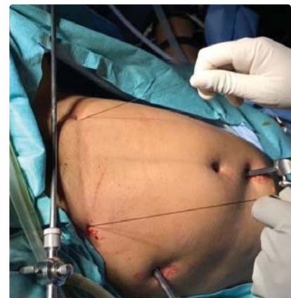
Figure 6: Silk thread taken out via subperitoneal tissue into the skin outside to get fixed into a traction device.

for approximately 8-10 hours per day during the first month. The dilators were made of soft latex, measuring 10cm in length, and were available in three diameters: 1.5cm, 2cm and 2.5cm. After use, patients were instructed to properly wash and sterilize them with antiseptic solution or normal water. Intercourse was allowed twenty days after removal of acrylic olive. All patients were called for follow up visit on day 15 and day 30 post surgery to check the vaginal length. Patients were comfortable and adequate vaginal length of approximately five cm was achieved in all (Figure 8,9).